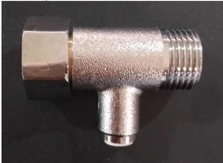
Included 304 adapter with 3/8" female and 1/2" male threads